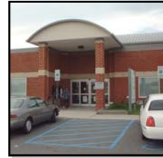
MVA Office Beltsville, MD

Note: Many documents are required to register a car or obtain a license. Call the MVA or FIRN to see what you need to bring.