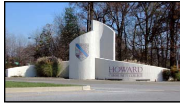
Entrance to HCC From Little Patuxent Pkwy.