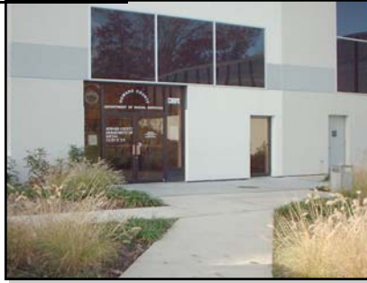
Department of Social Services