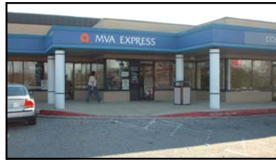
MVA Express, Columbia, MD

Services restricted to: License renewal, change of name or address on license, photo ID cards, copies of your driver's record and tag returns only .