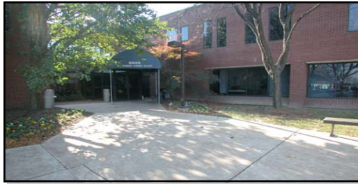
FIRN Entrance: Columbia Office