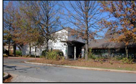
The Bain Center

There are many senior centers throughout Howard County. Call the main center to learn of location closest to you.