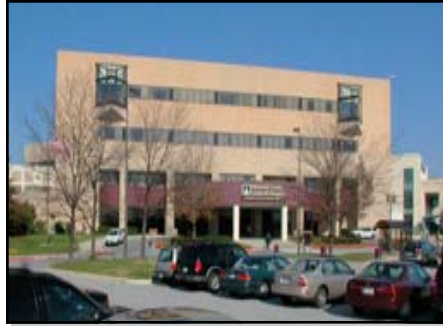
Howard County General Hospital