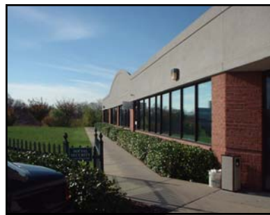
Lakeside Office Social Security Administration

Lake Side Building 8865 Stanford Boulevard Suite 110 Columbia, MD 21045